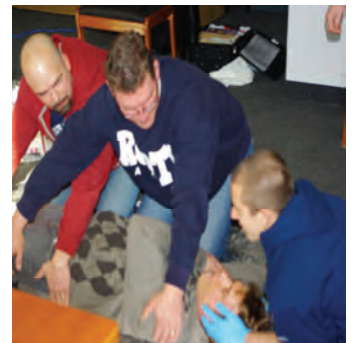
Above: First Aid/CPR course participants doing the hands-on portion of the course.