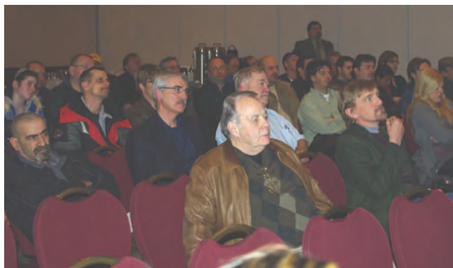
Pictured at left: Attendees listen to the candidates. Members of Local 30 were among those in attendance.