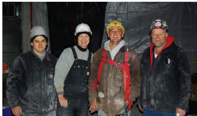
A crew from Sure-Way Metal Products working at the Air Canada Centre expansion