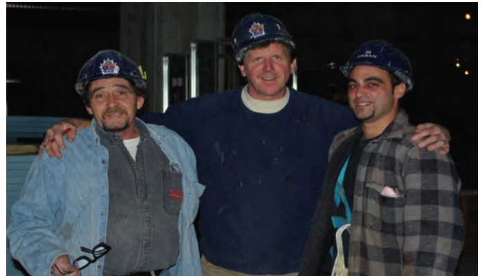
Two crews from Tam-Kal working downtown at Maple Leaf Square, 15 York St. Toronto