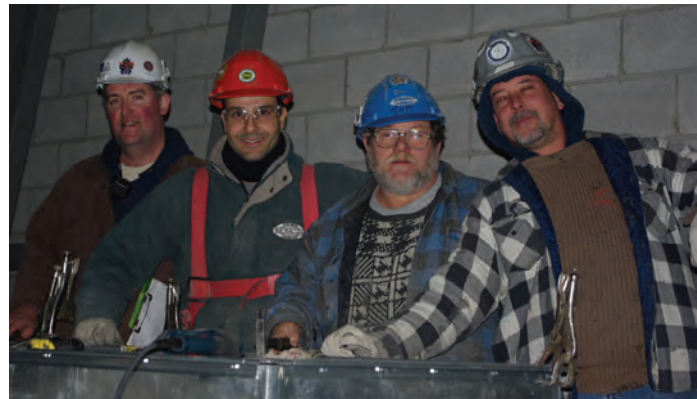
Two crews from Tam-Kal working at 25 York St. Toronto